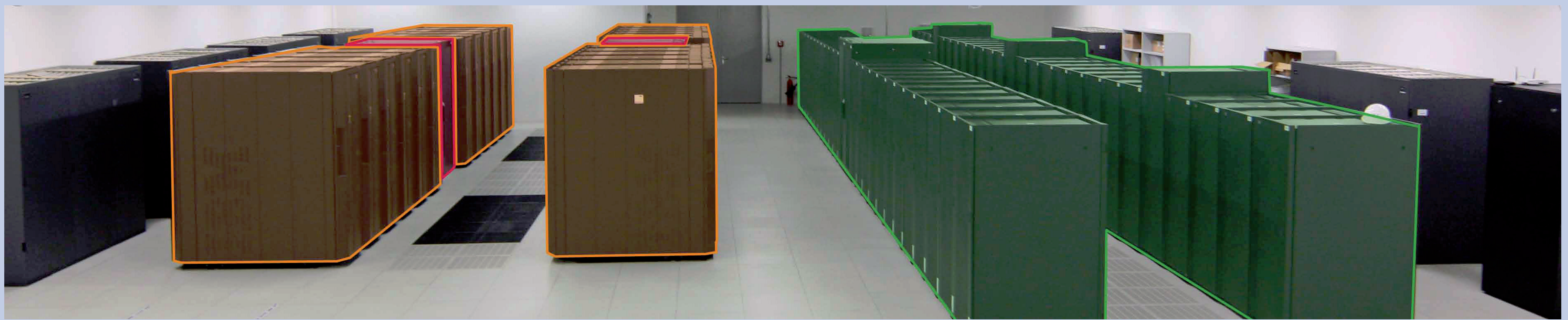
High performance computing system „Blizzard“ at DKRZ - compute nodes (orange), infiniband switch (red), disks (green)